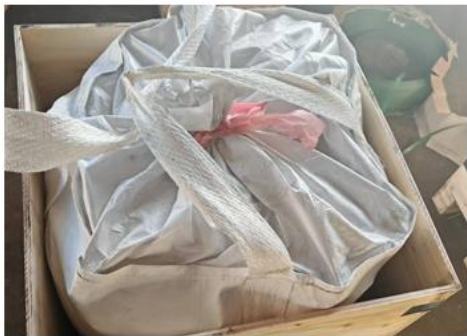
4.5mm shooting steel BBs for airsoft